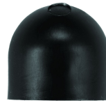
6LV1352 Light Shield Accessory for EK4036S, EK4436SM, K4000 Series Button Photocontrols